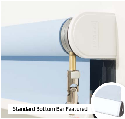
Standard Bottom Bar Featured